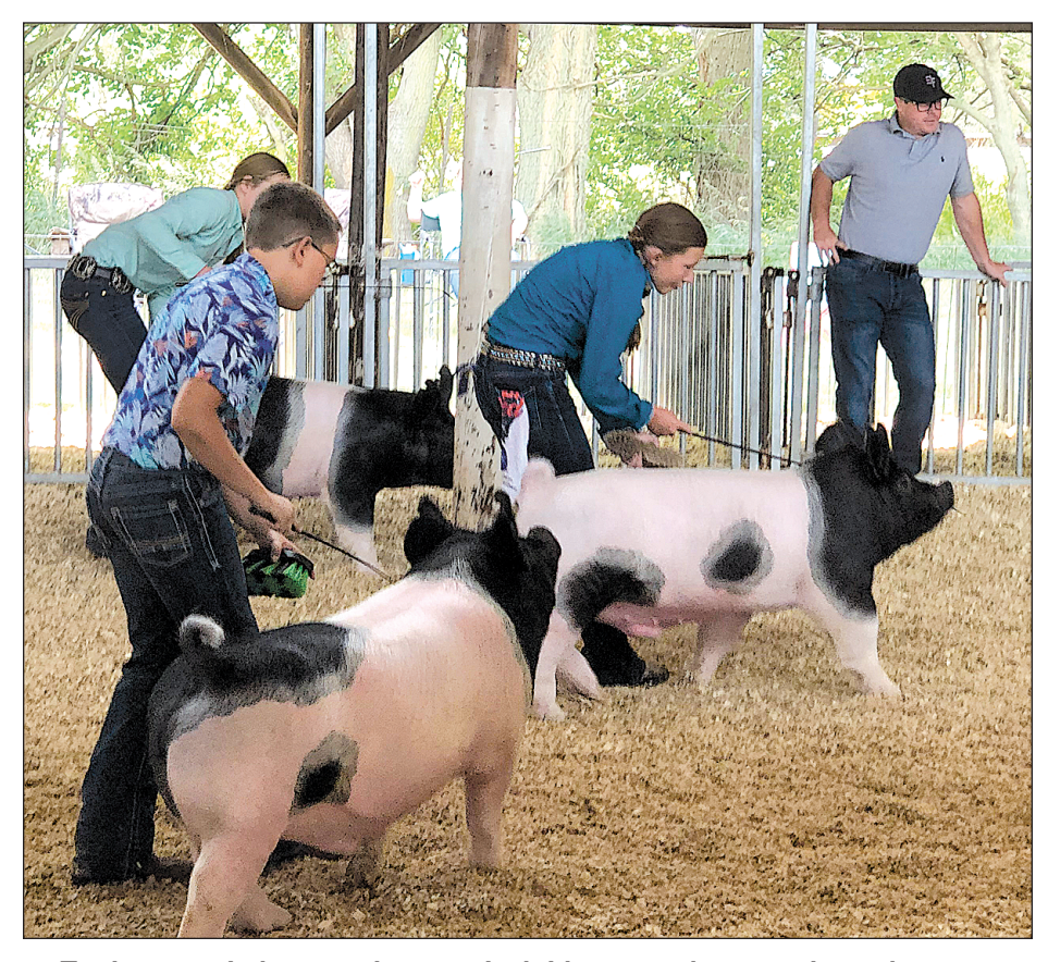
To the casual observer this may look like a race between hogs, but it is simply one moment of highly organzied livestock judging during a county fair with similar scenes occurring at fairs from north to south and east to west throughout Illinois during fair season when youngsters show off their skills and the quality of their animals.