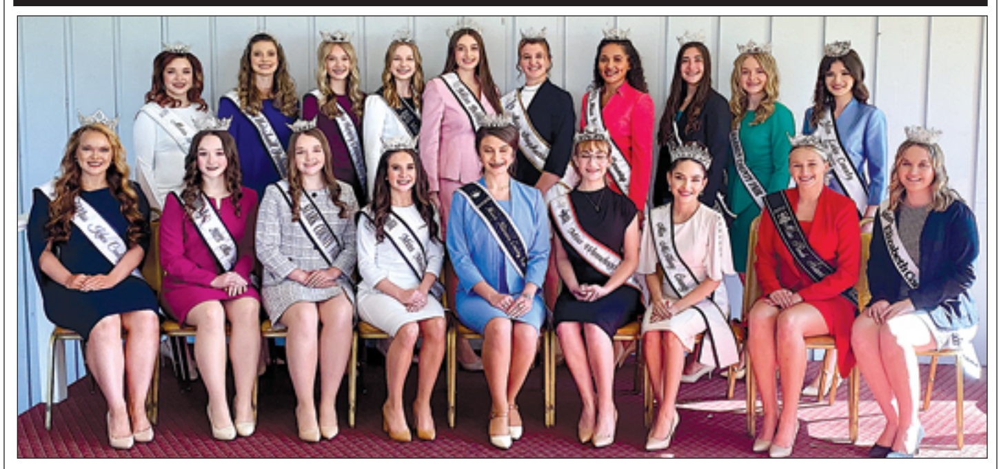
These County Fair Queens made their presence known at the IAAF Northern Zone meeting held Sunday, November 5, at the Pitstick Pavilion in