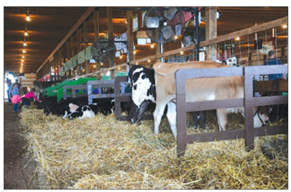
All aspects of agriculture remain the heart of Illinois County Fairs.

A 4-H alumnus will tell you that like other young adults, they make it home to visit only a few times each year: Thanksgiving, Christmas, Easter and during their home county