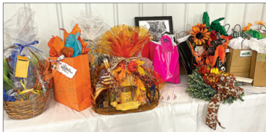
An added bonus to the zone meetings is winning one of the many door prizes. These are just a few of the many offerings.