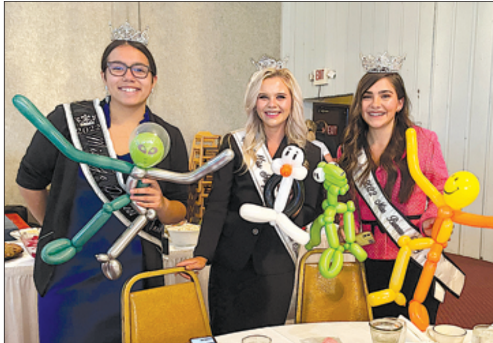
County fair queens joined in the balloon fun at the Northern Zone meeting.