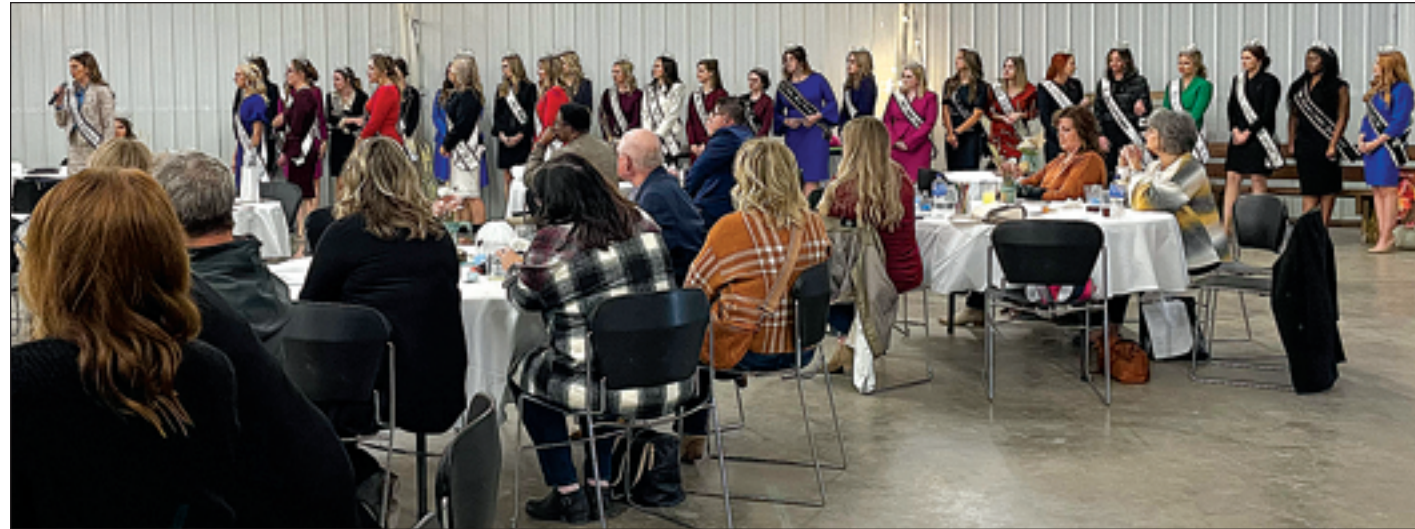
Attendance was great at the Central Zone meeting held for the first time at the Morgan County Fairgrounds.