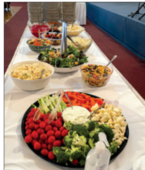
The food at the Pitstick Pavilion is always good.