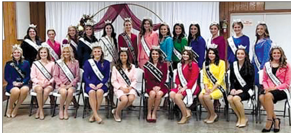
A large contingent of County Fair Queens were at the Southern Zone meeting.