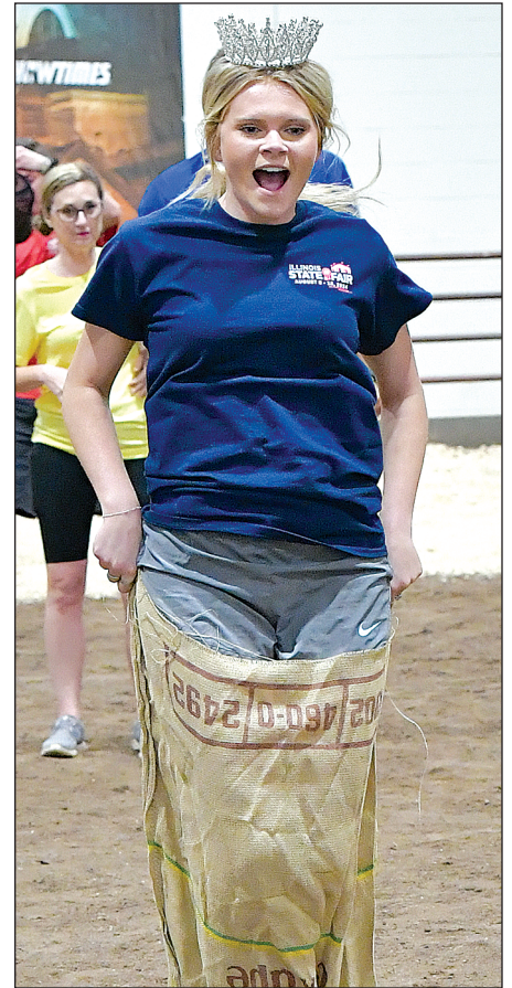
Bag races are also difficult to master with no training.