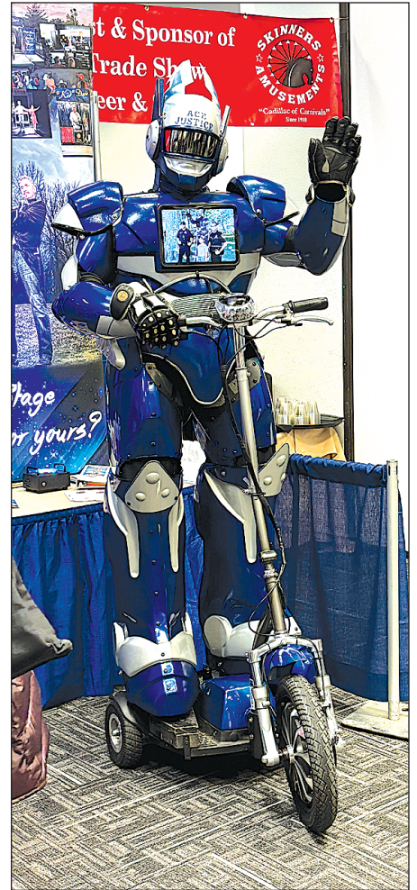
Robot Ace Justice took over the trade show during the 2025 Annual Illinois Association of Agricultural Fairs held January 17-19 at the Crowne Plaza in Springfield. He can be encouraged to attend Illinois Fairs and wow spectators of all ages who always look for the latest.