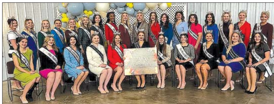
Central Zone Queens Attnded the Zone Meeting.